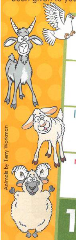
Animals by Terry Workman

The Israelites brought many lambs, goats, rams and doves to sacrifice at the tabernacle. In this grid, each type of animal has its own secret number . When the numbers going across each row are added together, they equal the totals at the side. When the numbers going down each column are added together, they equal the totals at the bottom. The number for the doves has been given to you. (HINT: Start with the lamb column first.)